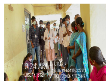
National Nutrition Month - Health Education program.