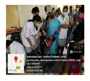
DOAP sessions in progress