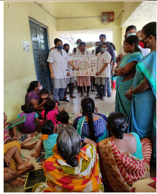
Observation of National Nutrition Month at an Anganwadi center, Anandapuram.

"Delivering comprehensive health care services spanning across the spectrum of health in an equitable manner is what we always strive for".