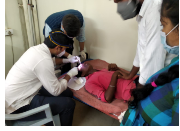
Specialist emergency care at RHTC, Anandapuram.