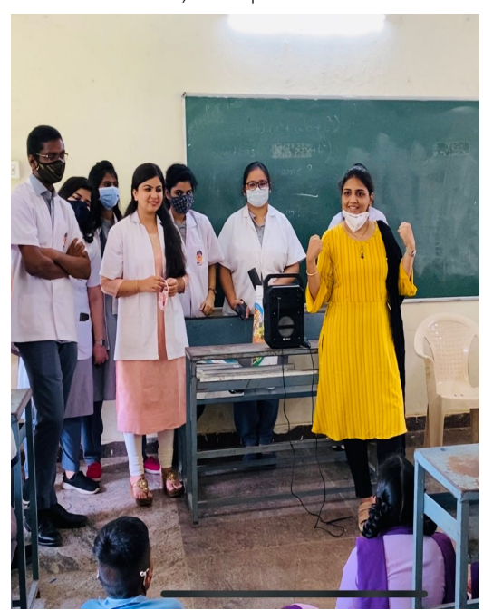
Interactive Adolescent health education program at Z. P. High School, Anadapuram.