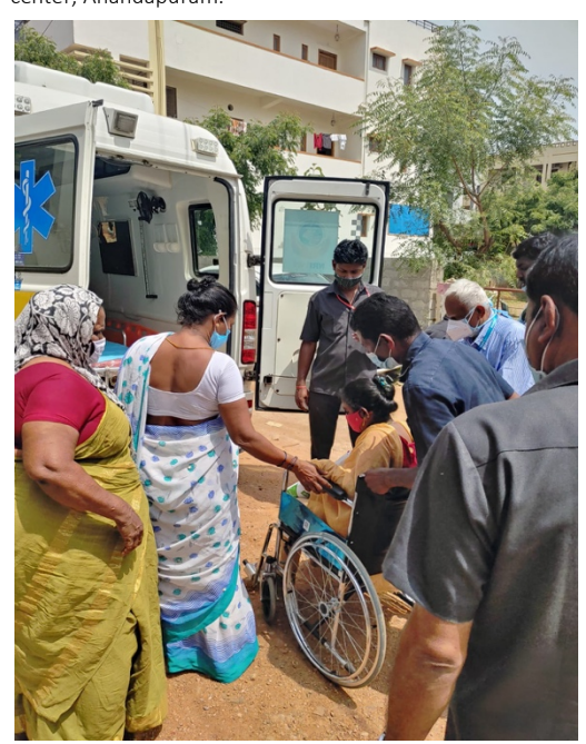
Emergency referral of an Ante-Natal mother to ANH.