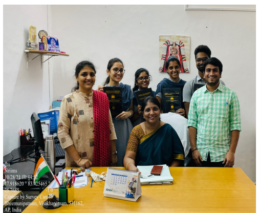
Students with research project submission reports