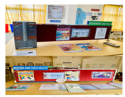
Upgraded Museum facilitating Self-directed learning for the students