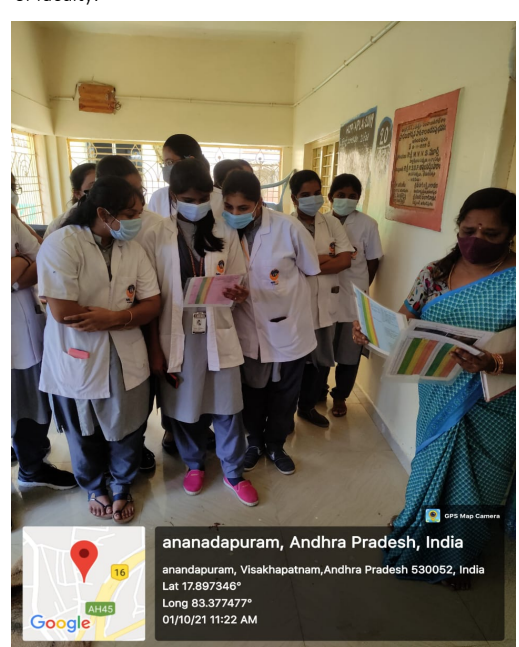
DOAP session in progress at Anganwadi center under supervision of faculty.